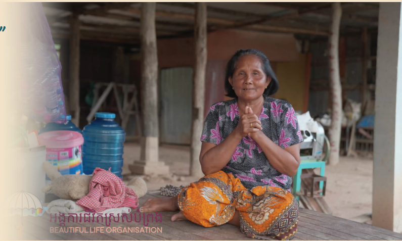
A video we had made featuring parents of LGBTIQ+ individuals

We reminded our participants that it was natural to want to protect their children from facing bad things, but ultimately impossible. Our role as parents and caregivers is to teach the necessary skills to stand up to discrimination that we will inevitably face, and to be part of their support network.